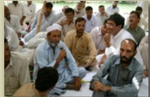
Negotiating and proposing

The networking diagram was used to make clusters. There were some adjustments made however as the links displayed were in some cases not based on choice. These groups were asked to review their priorities and decide if a facility could be shared rather than be present in each village e.g. a high school would need a certain minimum number of students. They were also asked to see if a water source could be shared, a road designed so that it was of greater benefit and more efficient. In essence, review and adjust these priorities so that maximum benefit could be derived through minimum investment. It was thus a process of negotiation and involved thinking beyond the village