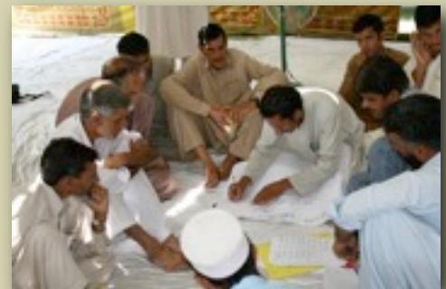
Costing and designing

The costs were tabulated and a cost for the overall URAP were finalised. In the end the final URAP was reviewed and final approval given. Each map was photographed for record purposes. These maps were then reproduced to reflect people's priorities as finalized in the workshop, existing facilities and government allocations as reflected in the PCI. These maps were professionally drawn, printed and taken to the people of the union council. This was achieved through a series of corner meetings organized by activists.