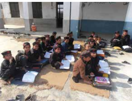
Taat (mat) school monitored by the Foundation's partner in Nowshera

An assessment of the preceding year's budget for FY2013-14 showed a block allocation of Rs.79 billion. Among subsequent allocations, Rs.51 million was given to the Chief Minister's home district of Nowshera for improving specified schools. This amount remained unused as of June 2014. Foreign aid of Rs.7.15 billion to provide urgently required furniture in schools also appears unused. The government's inability to utilize funds contrasts sharply with the urgency, it committed by declaring an education emergency. These findings raise the question: is the government's inability to use funds the reason it managed only 67 per cent universal primary education, falling far short of the 100 per cent target it had set? And is the lack of funds utilization the reason there is no furniture for schools monitored by the Foundation's partner in Nowshera, Mashal Welfare Organization?