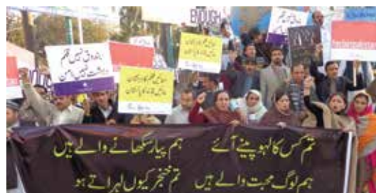
Citizens demanding government actions for peace

In FY2013-14, the Government of Khyber Pakhtunkhwa received Rs.22 billion as compensation for the war on Terror. Estimates for FY2014-15 include an even higher projected receipt of Rs.27.2 billion. However, details of expenditures are required to ascertain whether those affected by conflict benefit from these funds. In particular, sex-disaggregated data is needed to confirm that women, who are among the most vulnerable to crisis situations, are intended beneficiaries of related assistance such as the Rs.2.5 billion Conflict Victims Support Programme Funded by USAid.