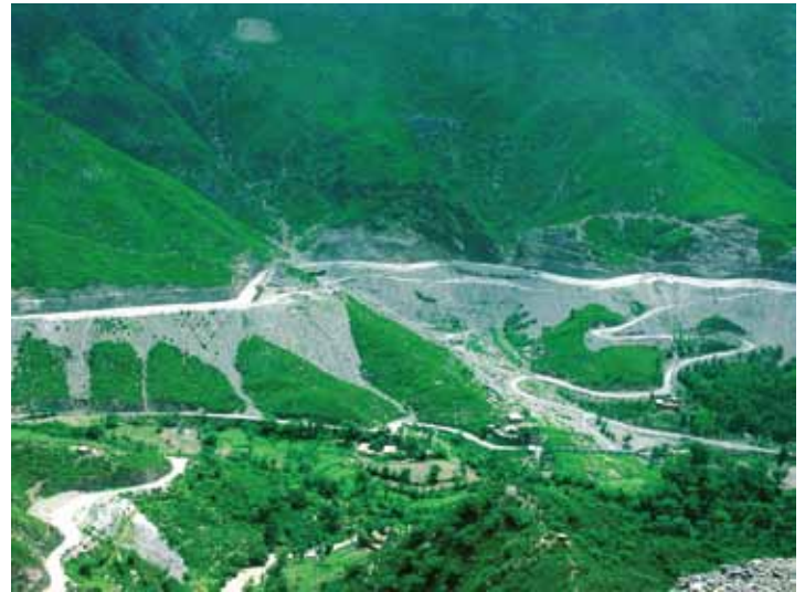
Nature's beauty - Swat

Swat was a place of beauty just like the heavens. Tourists would come here from all over the world. A few years ago, there were no Taliban and there were no atrocities.