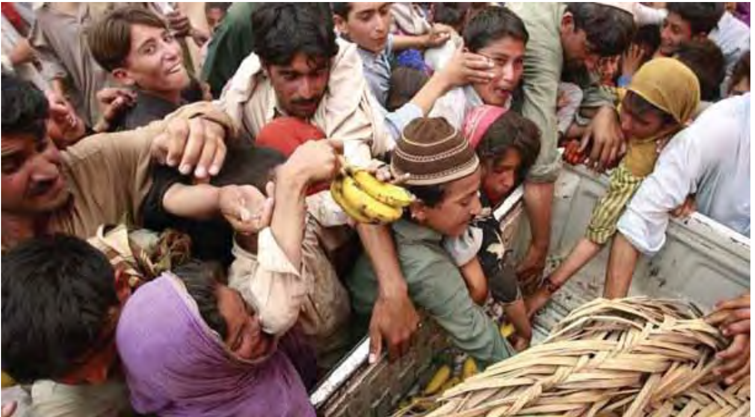
Food - a priority need

As is to be expected, food and shelter were the priority needs of people. Those forced to leave their homes acknowledged with deep gratitude the support provided by the people of Mardan and also from other parts of the country.