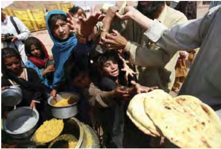
Queuing for food

People helped us with everything – food, charpoy, and utensils, etc. They helped us wholeheartedly. Some even offered shelter to strangers. Local people have done so much, but they are also now tired. Now we send children with utensils to homes to collect food. We eat what they collect from other homes. Sometimes we are able to eat and if not we go to sleep hungry. When the children wake up, we tell them to go back to sleep as there is no tea or gas.