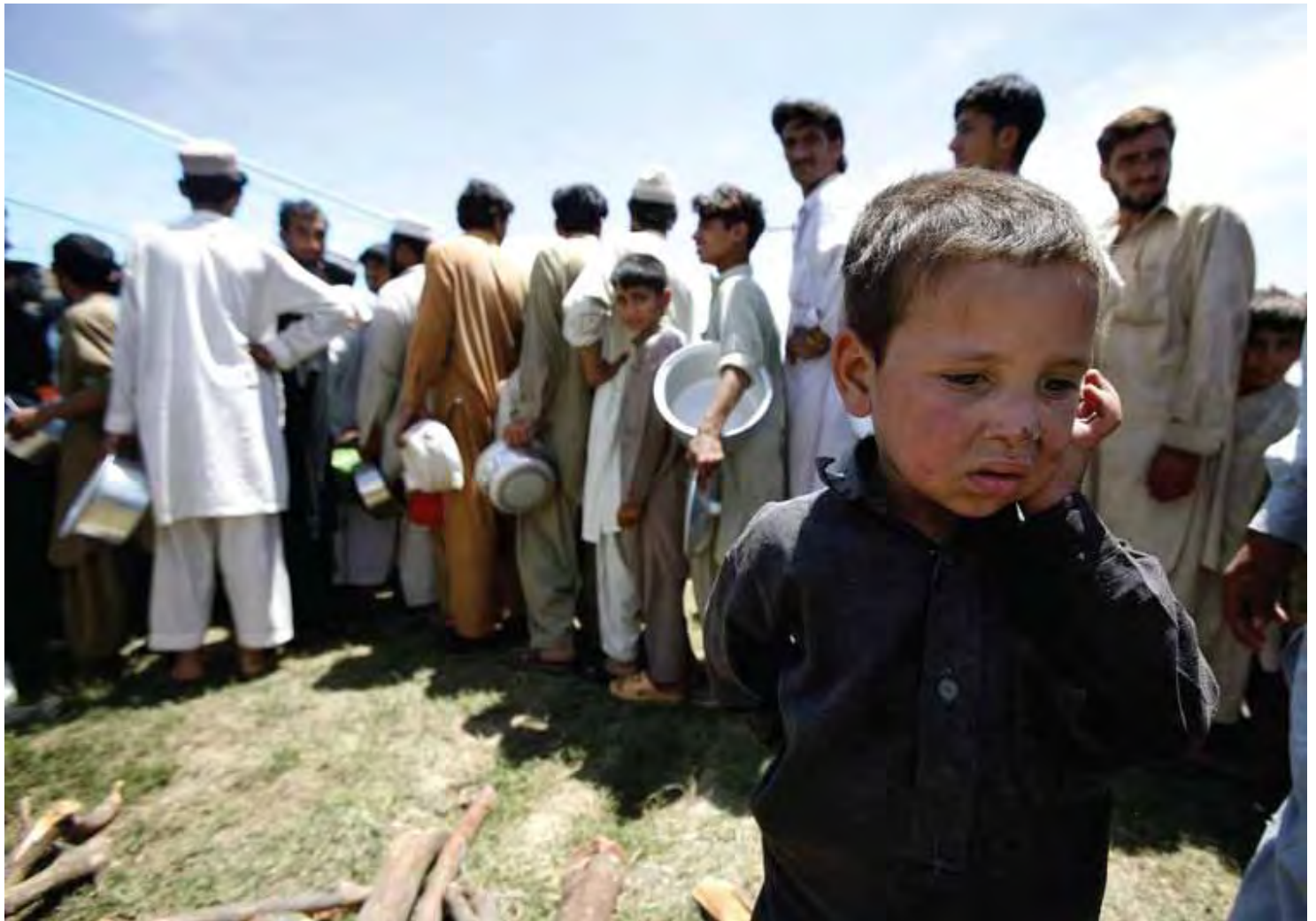
Tired and hungry

“We just want to go home. People are tired and exhausted by their unfortunate conditions, and are concerned that conditions may worsen. We need peace and stability. Our trials increased our anxieties beyond imagination. We are upset, tense, and frustrated. Children and adults are both afraid of any bang – we are even afraid of firecrackers.”