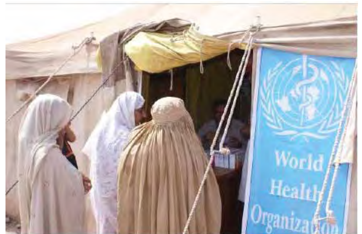
Healthcare - urgently needed

"My son and I are both ill, we have prickly heat. I got medicines from the school, but they didn't work. I then consulted a private doctor who told me that the medicines were expired. We are poor, what do we know?"