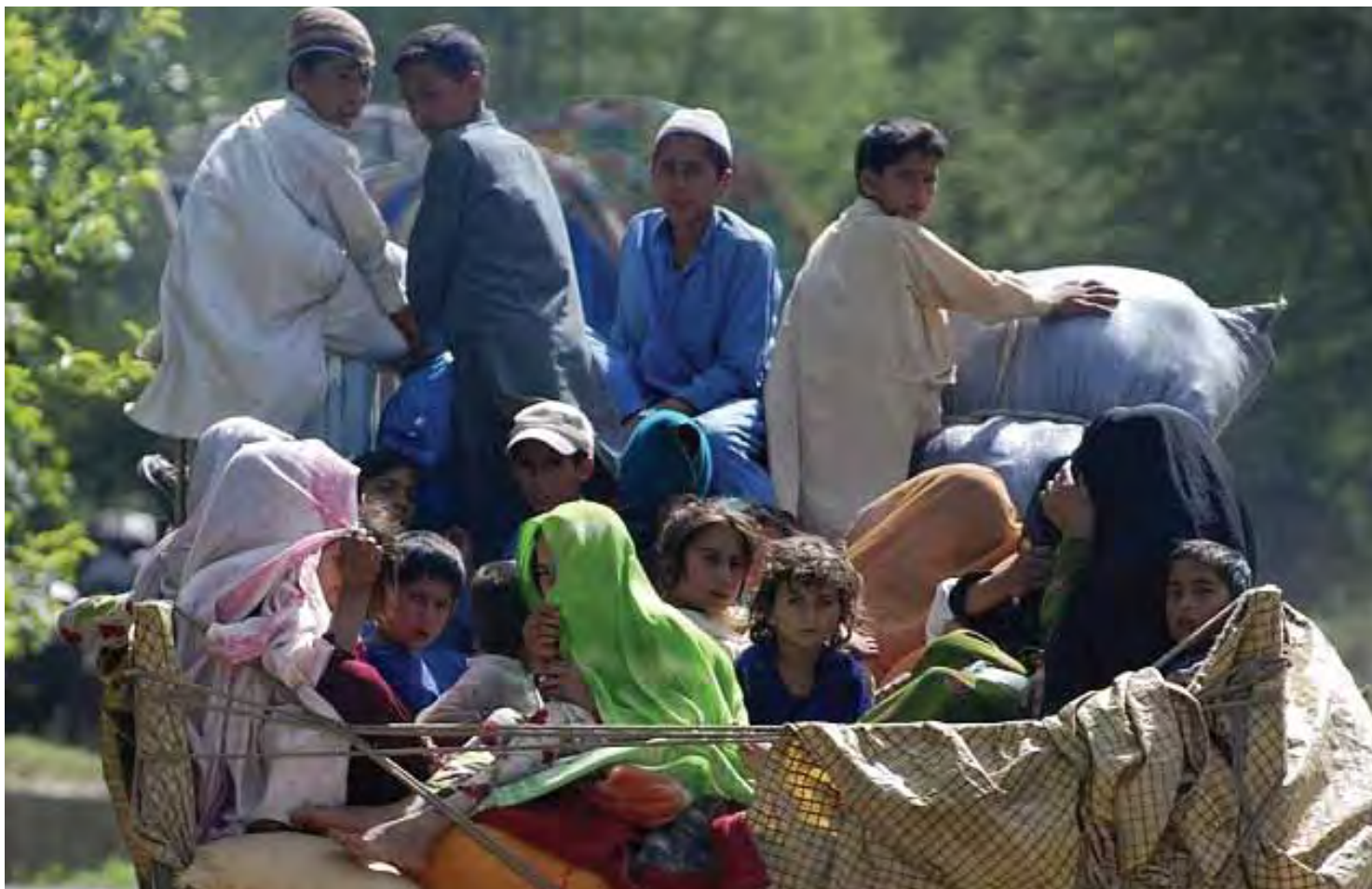
The long journey home

“Government must make transport arrangements and must tell us where they are taking us, and if they are taking us back home they must assure us that there is peace. The government must give us food stock for 3-4 months on our return as the conditions back home are still uncertain.”