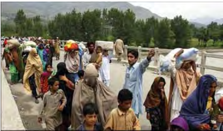
Fleeing armed conflict

“We fled to save our lives. We brought only our money and jewellery. Many were not even able to lock their house. We left as we were fearful of what may happen if we stayed. We grabbed whatever was at hand.”