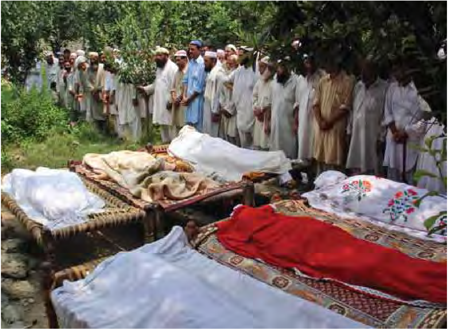
Mourning the dead

“Even if we had not left any one behind, others would let us know what was going on. Those left behind often had trouble using mobile phones (because all communications is jammed). The mobile phone cards that are normally Rs.100 were being sold for Rs.150. We have heard from others that the Taliban have looted the homes we left behind and took away whatever money was there.”