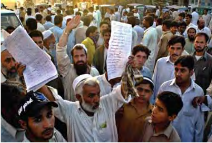
"Rs.25,000 is given as if it is Rs.25 crores (Rs.250,000,000)"

Some used the Rs.25,000 from the government for food rations as they had not received food from any other source. Some said they needed milk and clothes for children as they had only received some support once and were now left with nothing. People also faced many problems in the registration process. They were unsure where to go and what to do and were not adequately guided by the government.