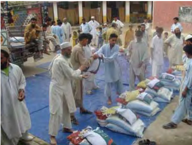
Food distribution by an NGO

“NGOs also played their role – their services are applauded. NGOs extended help from door-to-door and we are happy with them. Yet despite all the efforts of local people and NGOs, our needs are still not met. Like the US we are also demanding that they do more.”