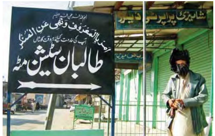
Taliban station in Matta

“Earlier, there would be a military checkpoint and then a Taliban one close by. This must not be allowed to happen again. The tussle between the Taliban and the military must conclusively end.”