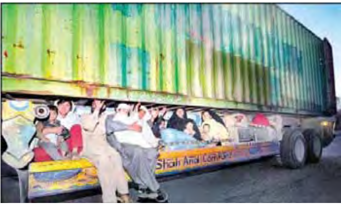
Any means of transportation

“Monthly stipends and other facilities like healthcare should be provided to orphans and other destitute people.”