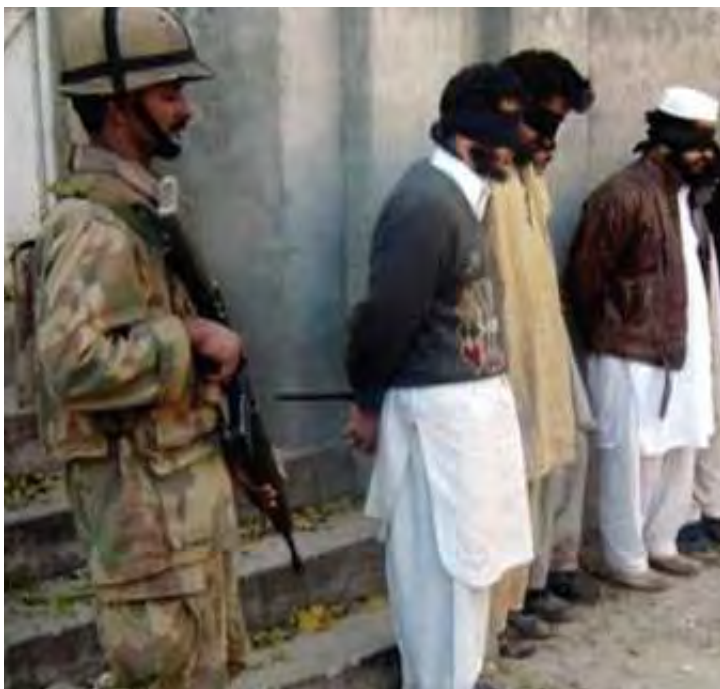
“Military should be able to distinguish ordinary people from the Taliban”

“Our military personnel are our brothers and we are prepared to work alongside them. Curfew must be lifted. The military needs to rebuild its image and regain its credibility among citizens by treating them well and with respect. Many innocent people were picked up and also killed by the military on the pretext of being Taliban. The military must act judiciously. Our enemy and theirs is the same. The military must act with due responsibility.”