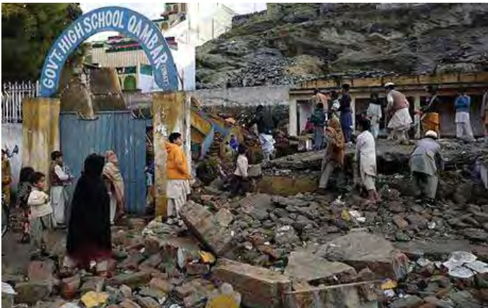
A destroyed school in Swat

“The Taliban had blown up schools and also destroyed houses. There was no business. They inflicted a lot of destruction. Many people were killed or injured during the armed conflict between the Taliban and the military.”