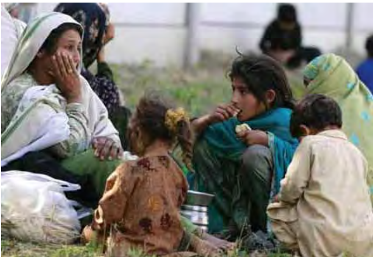
Homeless and uncertain

"I tell my husband to raise his voice, and he says who should I speak to? May God allow us to return to our homes now."